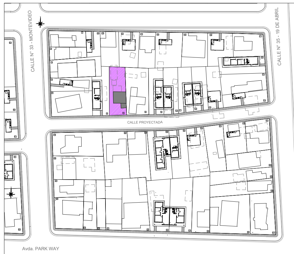
Plano de ubicación esc. 1.1000